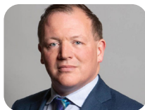
Damian Collins Member of UK Parliament